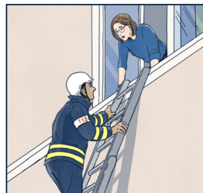
Emergency services will help you escape, if necessary.