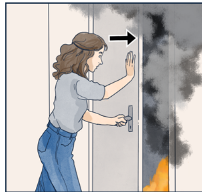
Close the door to the room that is on fire.