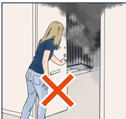
If there is a fire somewhere else in the building and smoke fills the stairwell, stay in your apartment.

An apartment door normally resists fire for about 30 minutes. Never enter a smoke-filled stairwell. Never use the elevator in a fire.