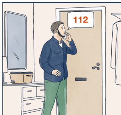
Keep the door closed. Report the fire to emergency services – call 112.