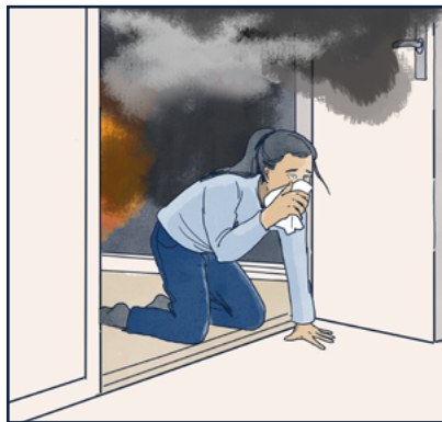
If you cannot extinguish the fire safely, get out.

First, make sure that everyone has escaped. Then close the door to the room or apartment that is on fire. A closed door limits the spread of fire.