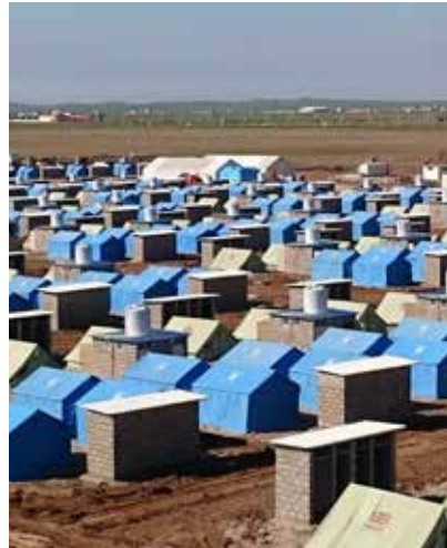
MSB shelter support in Dohuk, Iraq.

Staff Profiles: Site Planner, Shelter Officer, WASH Expert etc.