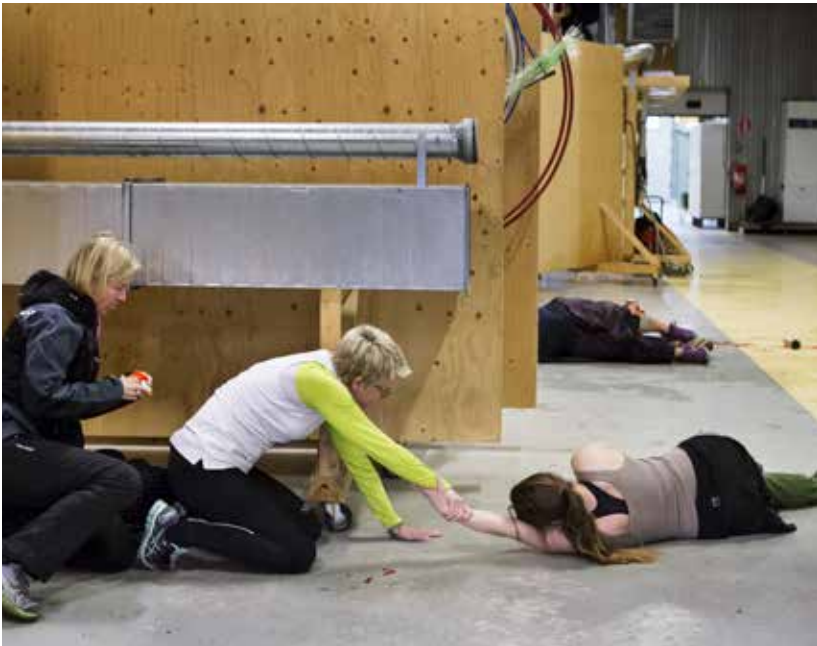
MSB security training in high-risk situations.

MSB staff will work under the requesting organisation's overall management and security arrangements, unless otherwise agreed. In most cases, MSB staff will be considered Experts on Mission and included in the security arrangements of multilateral organisations. Security and staff welfare is included in the MSB induction training, where the experts will familiarise themselves with the available MSB back-office system, including the duty-officers, security advisors, health and counselling services. All MSB field staff roster members undergo a health and welfare examination prior to departure and continue to have access to these services after the deployment have come to an end.