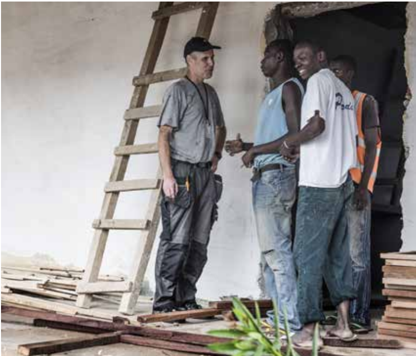
Support with renovations and establishment of permanent structures in 3 locations in the Central African Republic (CAR) to enable humanitarian presence.