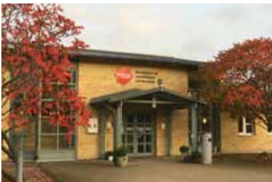
MSB college Revinge.