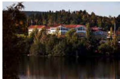
MSB college Sandö.