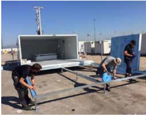
MSB support with prefabricated facilities in Greece.

By strengthening infrastructure, construction and logistics, the aim is to enable humanitarian access, increase response capacity and facilitate coordination. MSB supports its partners with logistics and infrastructure solutions, often in remote areas, to improve living and working conditions for humanitarian and aid workers. Base camps and prefabricated facilities can be deployed on short notice to emergency situations and longer term fixed construction can be provided to facilitate field presence and response operations. These support modules normally include kitchen and sanitary solutions and can be upgraded to include security and medical support, to ensure a safe working environment. The equipment will normally be donated at the end of each mission and the management and maintenance responsibilities handed over to the requesting organisation.