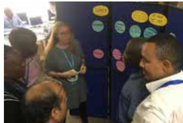
Resilience Programming: MSB support with risk informed programming at country level in Malawi.