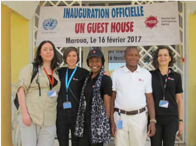
MSB HQ and field staff take part in the inauguration of the MSB built guesthouse for humanitarian workers in Cameroon. The project integrated gender and environmental aspects throughout the process.

Gender, diversity and environmental sustainability are applied and integrated in all MSB support, on a policy and operational level. MSB believes that cross-cutting issues should be prioritised, not only for ethical and human rights principles, but also that it secures better results, equality and sustainability. For example, gender and vulnerability aspects are integrated in all projects directly or indirectly as well as minimising the environmental footprints of MSB's actions and projects. MSB field staff are required to sign the MSB Code of Conduct, which includes limitations and respectful behaviour in terms of e.g. gender, vulnerable groups and environmental impact. As such, cross-cutting issues underpin all MSB efforts and operations.