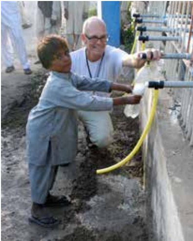
MSB water and sanitation project in Pakistan.

In an effort to rapidly establish basic services to an affected population, MSB supports its partners with expertise and equipment. Access to adequate shelter in humanitarian emergencies is critical and MSB can provide emergency shelter, in line with the SPHERE guidelines, to support the protection of affected populations. Furthermore, MSB can provide support to the planning and establishment of refugee and IDP settlements and reception centers through provision of expertise within site planning and shelter. Clean water, basic hygiene facilities and hygiene practices are essential for survival in emergencies and MSB can provide expertise within WASH to minimise water contamination, ensure safe hygiene practices and the provision of safe drinking water. MSB also strives to ensure that gender, vulnerability and the environmental considerations are integrated into the projects.