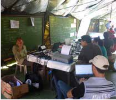
Coordination support during and after the hurricane Irma in the Caribbean.