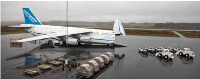
MSB staff and equipment on their way to support the humanitarian crisis in Cox Bazar, Bangladesh.