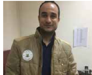
Crisis Management and Risk Assessment training for staff at the Joint Crisis Coordination Centre (JCC), where visualisation of threats and risks in the region were conducted.

Staff Profiles: Coordination Expert, Information Liaison Officer, Duty-Officer, Crisis Communication Expert, Aid Coordination, Training Officer, Information Management, Analysis Expert, Gender Advisor etc.