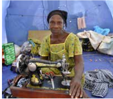
MSB support (in collaboration with Lions) with temporary shelter solutions in Liberia.