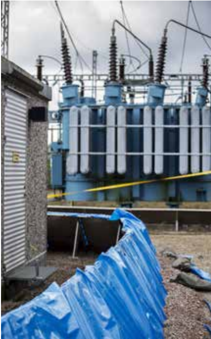
National response teams: MSB-flood barriers protecting critical societal infrastructure.