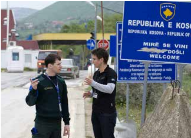
Peace support operations: MSB Camp CIS Officer supporting the EULEX mission in Kosovo.