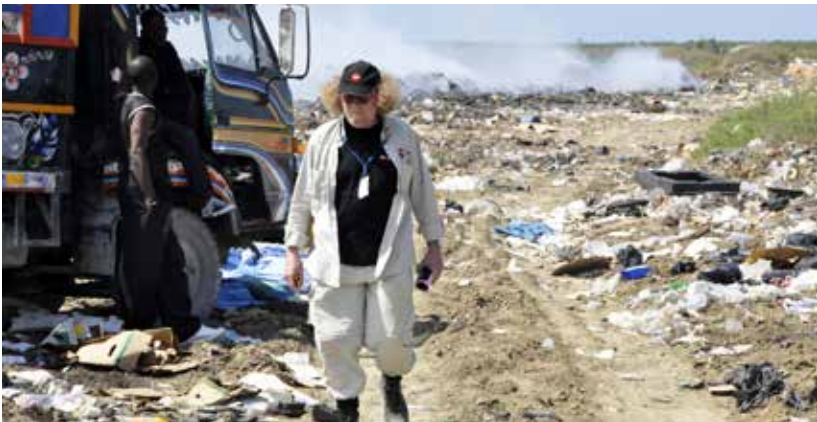
MSB support to UNEP/UN Environment with managing health care risk waste in Haiti.