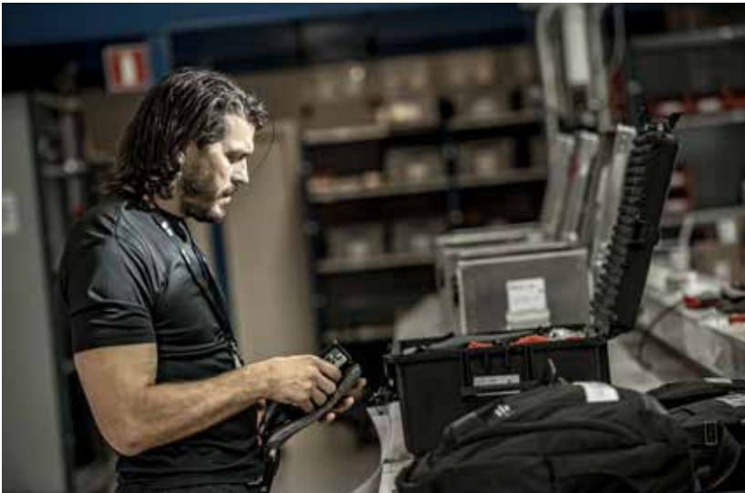
Quality assurance and packing of ICT equipment.