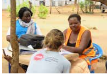
Humanitarian assistance: the planning phase for support with temporary shelter and permanent structures in 6 locations in northern Uganda.