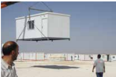
IHP support to the Zaatari refugee camp.

MSB is active in the International Humanitarian Partnership (IHP), which is a voluntary multinational operational network between eight emergency management agencies in Europe. Each agency of the IHP is a part of, funded by and supported by their respective governments. The strength of the IHP lies in the flexibility and capacity to combine national resources to deliver joint response efforts in case of disasters and complex emergencies. For example, the IHP has standardised modules, such as large base camps for aid workers. To date, the IHP has delivered more than 100 joint deployments to assist emergency response efforts around the world.