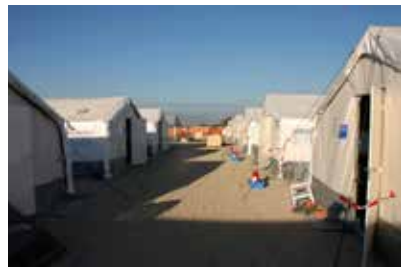
IHP base camp Charlie in Haiti.