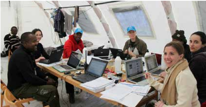
Field based simulations exercise.

Each year, MSB conducts and hosts approximately 60 international trainings and field based simulation exercises, for MSB field staff members and partners. In addition to the MSB Field Staff Induction Course, specialised trainings and exercises are offered in the following areas: disaster waste management, ICT, environment, coordination and assessment (UNDAC/EUCP), logistics, information management, mine action, security, host nation support, capacity development, disaster risk reduction (DR4), simulations etc.