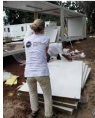
The erection of a fully equipped prefabricated camp in northern DRC.

Staff Profiles: Architect, Construction Engineer, Site Planner, Camp Manager, Camp Technician, Electrical Engineer, Bridge Expert, Road and Water Engineer, Water Engineer, Water Supply Expert, Medical Doctor, Registered Nurse, Security Officer, Logistics Officer (Air Movement, Transport, Warehouse, Convoy, Mechanic, Workshop Manager) etc.