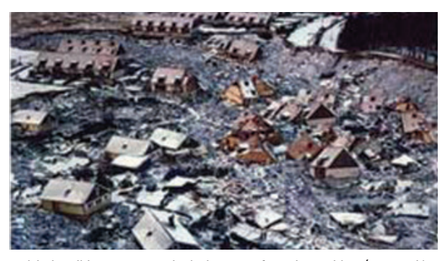
Quick clay slide.