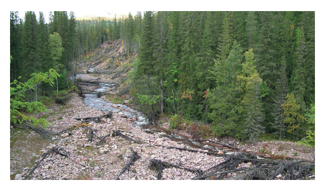
Debris flow.