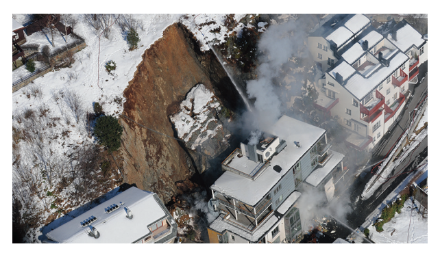
Rockslide, Source: Sunnmøre Police District