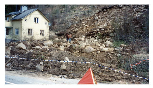
Moraine slide