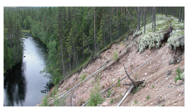
Landslide in coarse-grained soil.