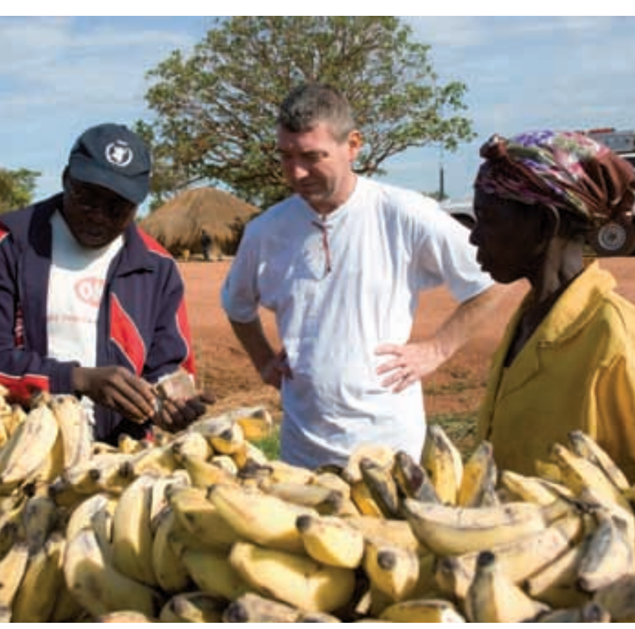
The MSB's purchase of products and services should be fair and should not benefit one party in a conflict or certain groups in society.