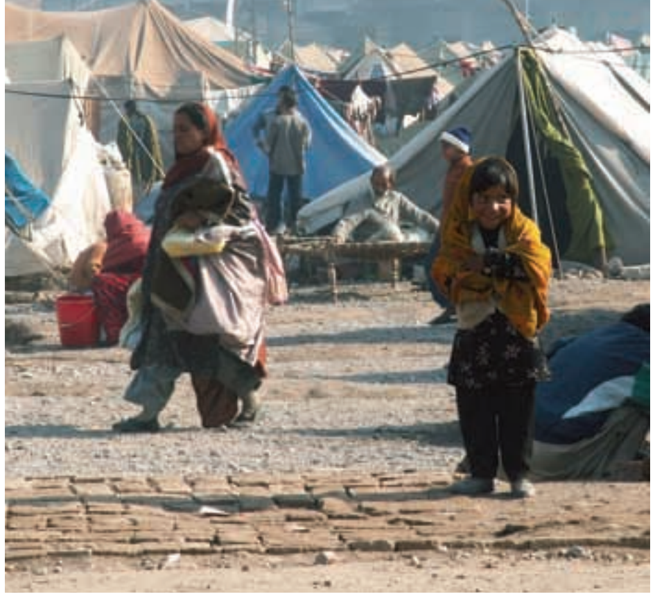
An important part of projects is reaching the entire population and seeing to women's and men's needs. The MSB's gender advisers can provide information and concrete advice.

support in the project planning for working on these issues.