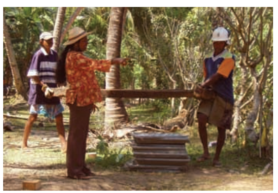
An equal gender balance and the recruitment of women into trades traditionally considered non-female is actively pursued.

Test your own prejudices and think about the arguments that, "This is not for women" And, "I have nothing against employing women, but this is too heavy, a woman quite simply cannot perform this work". Is this correct? Is physical strength the dominant factor for performing work within the framework of the mission, or are there other qualifica tions and merits that are equally as important? Emphasise and demand these merits in order to make it possible for more women to work on the project.