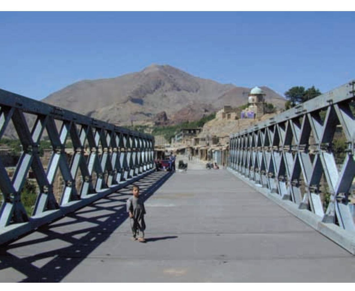
It is important to take into consideration the needs of the affected population. Will women, girls and boys also be using the bridge when it is dark, thus increasing the risk of being run over?