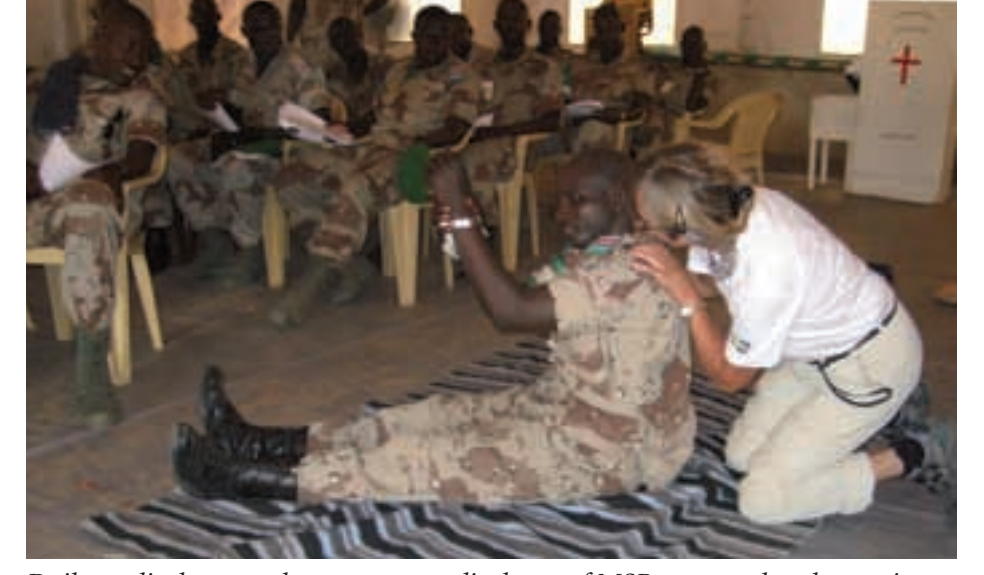
Daily medical care and emergency medical care of MSB personnel and sometimes other international personnel is included as a responsibility of the medical professionals.