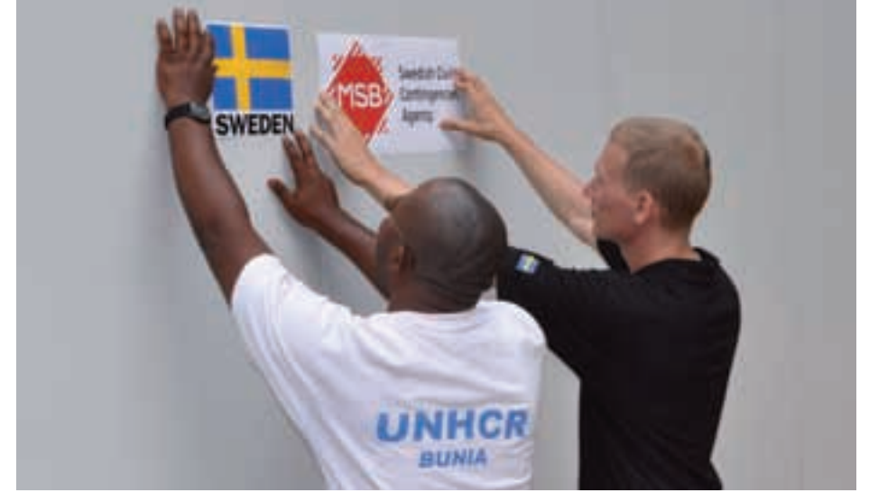
When in contact with partner organisations you can introduce a gender perspective into the project in different ways.