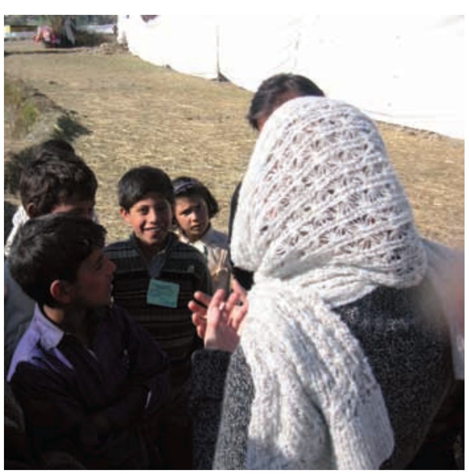
Women's participation and opportunities for contributing are human rights and in some situations are crucial for achieving the results desired of the project.

Example: Male ambulance drivers could not reach everyone A "women's mobile team", an ambulance team made up only of women, is a part of the civil defence organisation in Karachi, Pakistan. There are areas that male ambulance drivers are not allowed into due to the culture. To have a female ambulance team is the only way of reaching women. It should not be assumed that women automatically cannot or are not allowed to perform certain types of work. There might be competent female staff but they might also need to be actively looked for.