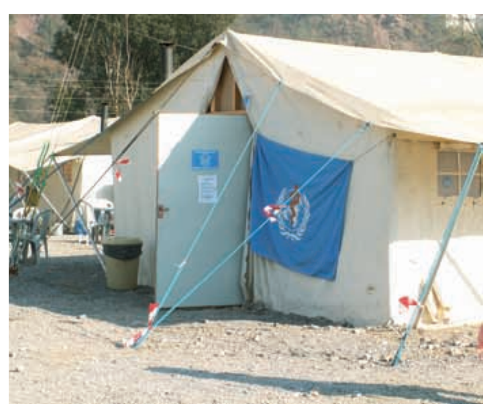
Find out who will be affected by the design of the base camp and how this will affect the planning and implementation of the project.