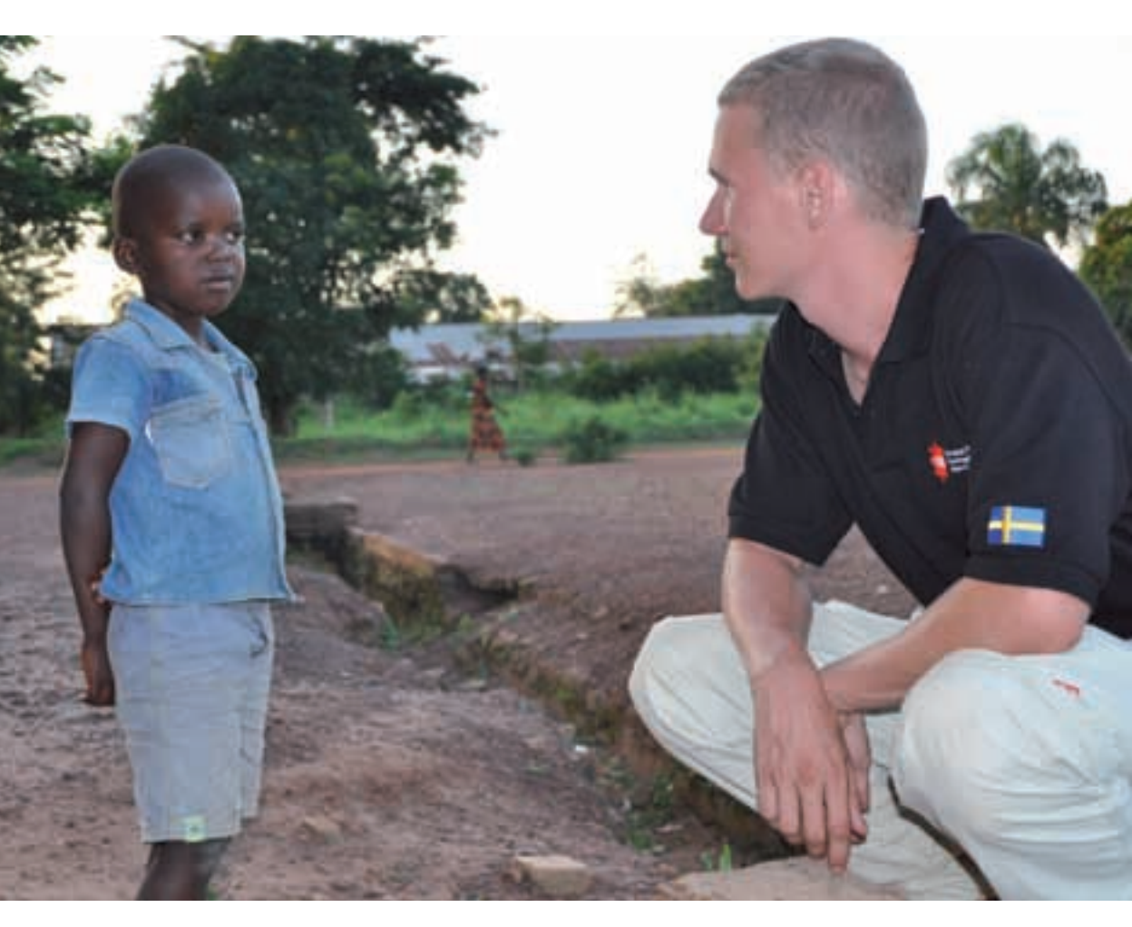
The MSB's code of conduct obliges all personnel to observe the ethical rules that the MSB has drawn up.

The point of departure for these rules is based on the concept that every human being is of equal value regardless of gender, ethnic background, sexual inclination, political opinion or disability.