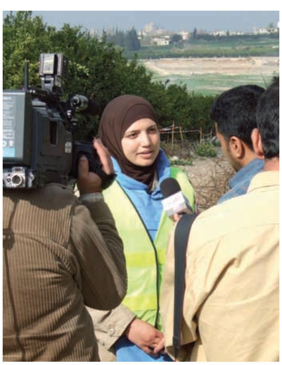
The female demining team was the first of its kind in the world.