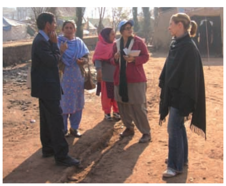
Local women's organisations and female community representatives can provide important information on women's circumstances and needs.