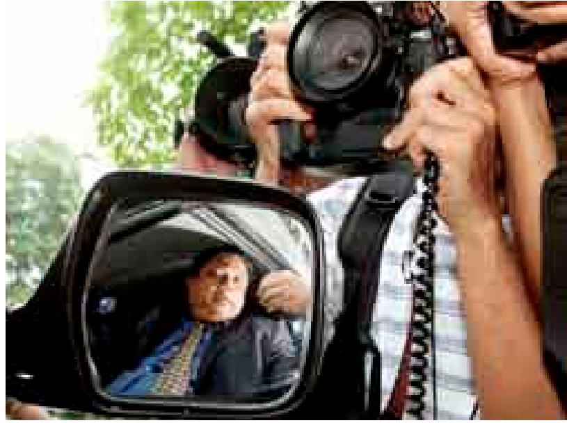
Tommy Suharto's defence lawyer is chased by photographers after his client failed to appear in court to hear his judgement. October 2, 2000 in Jakarta.

But more information via online newspapers, free newspapers and television leads to greater competition and pressure. The question is whether greater speed, variety and pressure have affected quality? The answer is not categorically negative. Pressure increases the risk for blunders, errors and miscalculations, but opportunities for the public to access important information have dramatically improved.