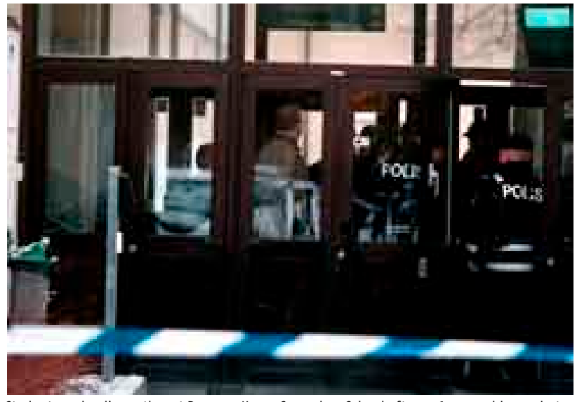
Students and police gather at Bromma Upper Secondary School after a 16-year-old was shot dead at the school.

The goals should be written down and understood because this will be more effective, and show how even more channels are available for reaching your objectives.