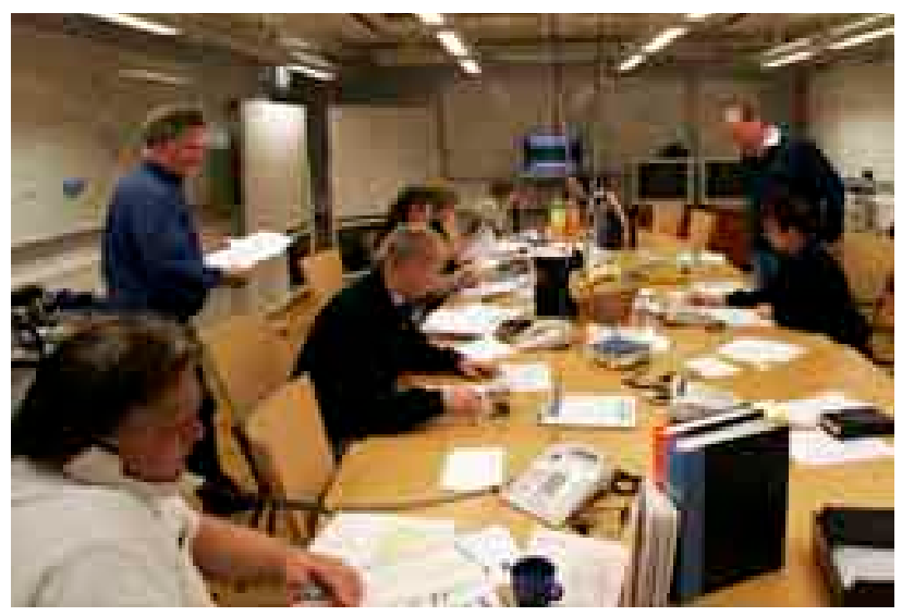
The Emergency Management Unit in Region Västra Götaland held a press meeting to present the results of their response so far to the tsunami disaster in Asia. The liaison centre is open 24 hours per day during emergencies.

A team of role-playing television reporters can monitor officials in the organizations that take part in the exercise. The television team can also cover mock press conferences. Television and radio features (interviews and edited press conferences) should be sent to participants over the internet during the exercise.