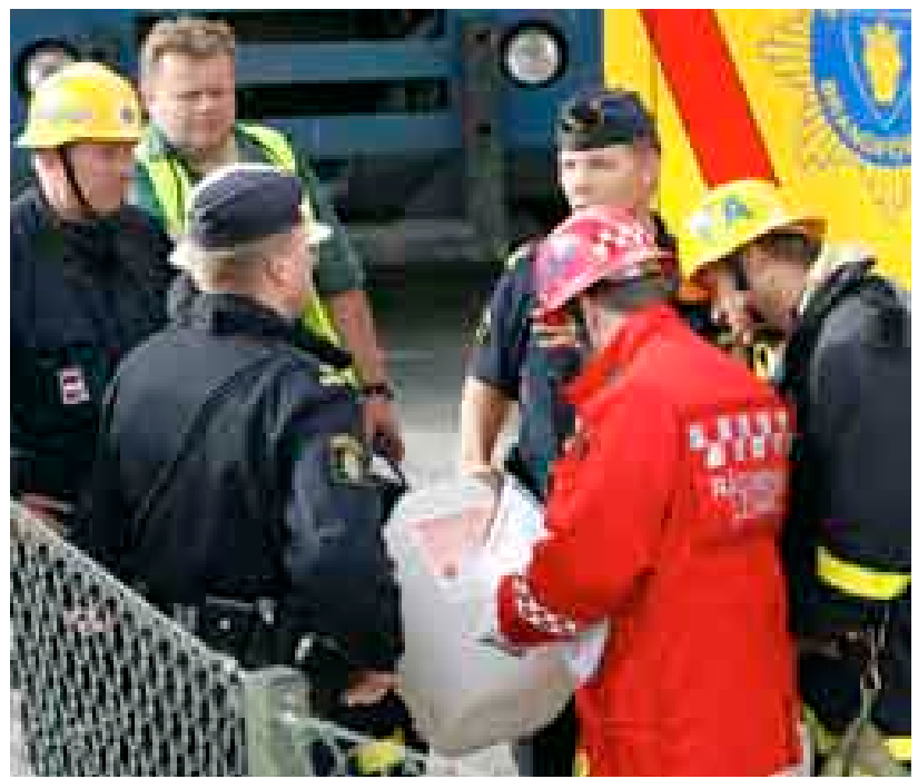
Rescue workers examine a plastic container after a probable gas emission on the Finland ferry Cinderella at Stadsgårdskajen in Stockholm on Sunday, May 21, 2006.

The most important – and difficult – concept when responding to a crisis is "transparency". The public's willingness to trust and follow an authority's instructions during a crisis is based on that authority's credibility. A closed organization generates suspicions of bad management, incompetence, etc. But this is a complex area, because the whole picture does not usually emerge until much later. Information can be unreliable during the early stages, and authorities do not want to sound uncertain or unknowing.