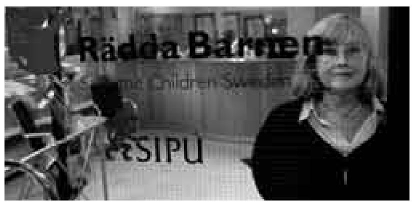
Save the Children Sweden has long experience of working with children and grief.

Communication efforts that focus on people in crisis require a high degree of expertise. Thinking informatively is vital, and transparency and accessibility should be the primary goals for your information processes. Transparency and accessibility are not always present in a public sector setting. All communication should be guided by a realistic and detailed picture of the target groups: the victims, the public authorities and organizations who respond to the crisis, the general public and potential employers.