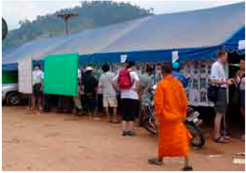
Photos of missing people after the Boxing Day tsunami at a Help Centre in Khao Lak, Thailand.

A central information channel for victims and their families that provides relevant and up to date information requires access to information. Both horizon scanning and a solid knowledge base are essential. Relevant websites should be constantly reviewed.