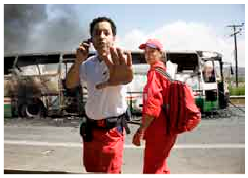
Road accident involving a tanker truck and a bus on Crete, summer 2006.

Responding to the crisis and the picture of the crisis should go hand in hand.