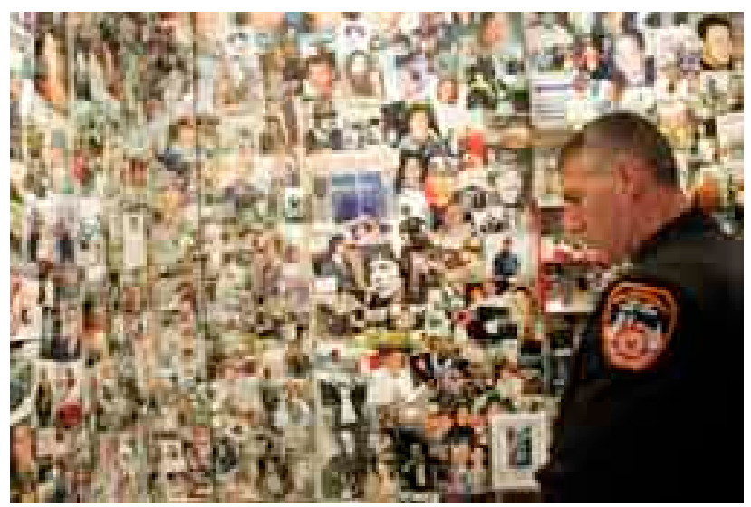
A wall with photos of people who died in the September 11 attack. Tribute Visitor Center has been created to show glimpses and fragments of the two towers and the people who lost their lives there.

And for the youngest members of the target group, you could publish and reproduce information that is particularly relevant to children and their families. One example is a Question Letterbox, where experts answer children's questions.