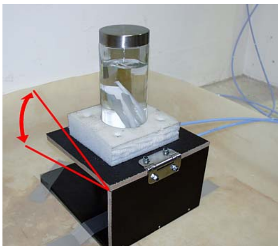
Fig 2. Agitating test performed by a tilting motion.

The test is performed by letting several test rods be submerged into a container with chemical substance (table 1). The container then becomes agitated through a pneumatic cylinder that creates a tilting motion (fig 2). Simultaneously containers with rods are left in a static state for comparison.