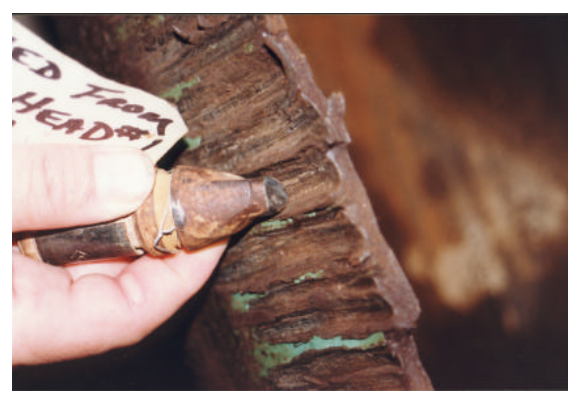
Figure 2. Comparison of cutting tool tooth with gouges found at rupture site

consistent with the size and shape of the gouge marks in the vicinity of the rupture. (See figure 2.)