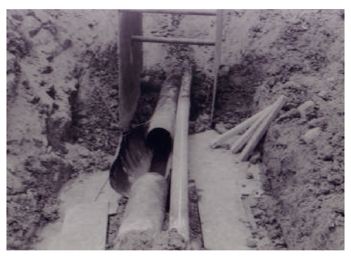
Figure 1. Postaccident excavation revealing relative positions of 8-inch distribution main and 20-inch transmission pipeline at site of rupture

On-site inspection of the ruptured pipe revealed a near-longitudinal gaping fracture about 5.8 feet long. Along the entire length of the longitudinal fracture, the newly installed 8-inch distribution main was within approximately 4 inches of the 20-inch transmission pipeline. (See figure 1.)