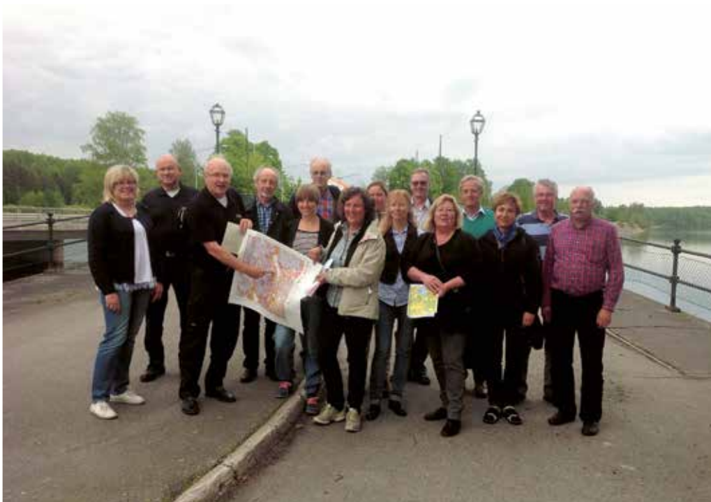
The Auth.Net's annual planning days were held in Säfsen, Dalarna with field visits to Lindesberg (bottom) and Nyhammar (above left).