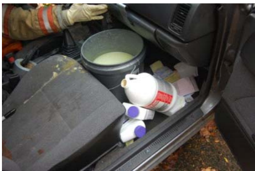
Fig. 3 (chemical containers and pail used for mixing)