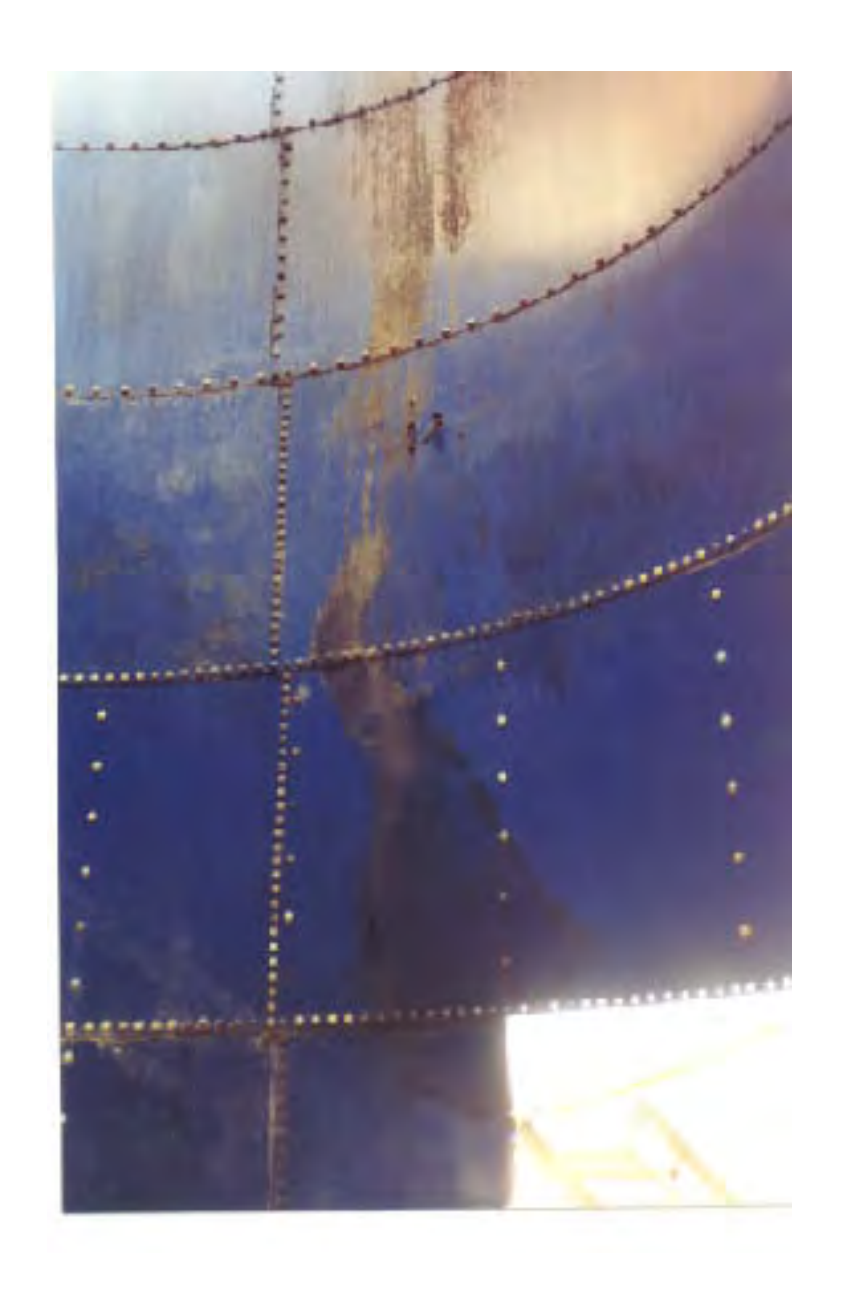
Photo 8. View from inside silo showing burned-out areas in relation to access panel (origin of explosion)