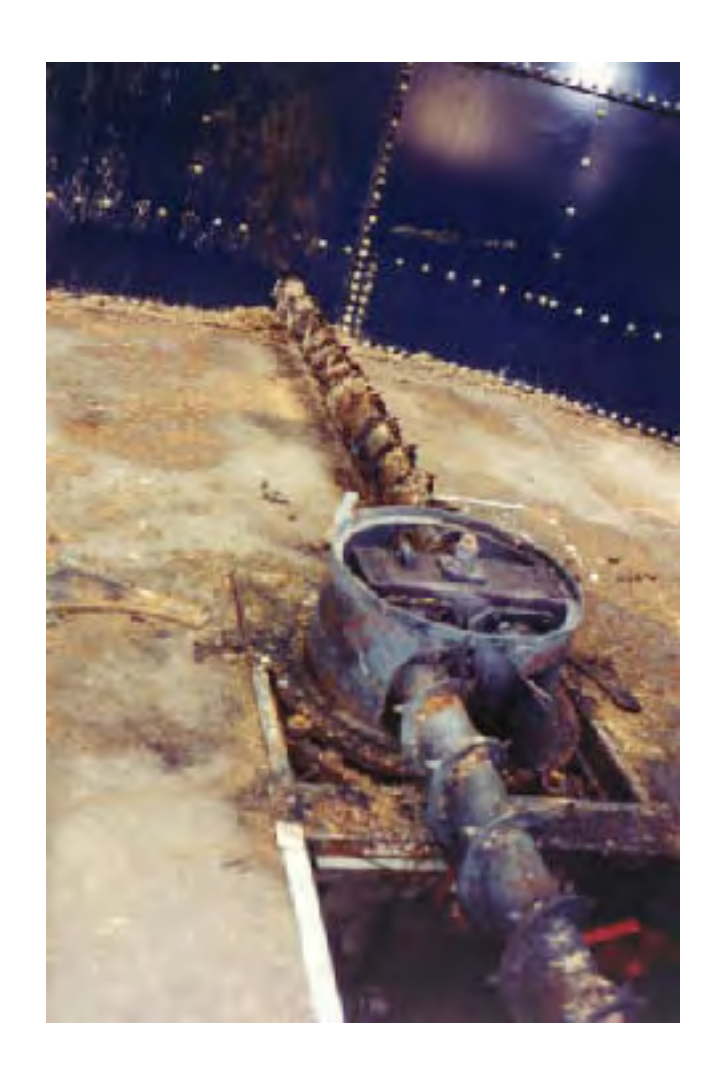
Photo 4. View of auger inside silo; fire burned along the auger shafts to access panels