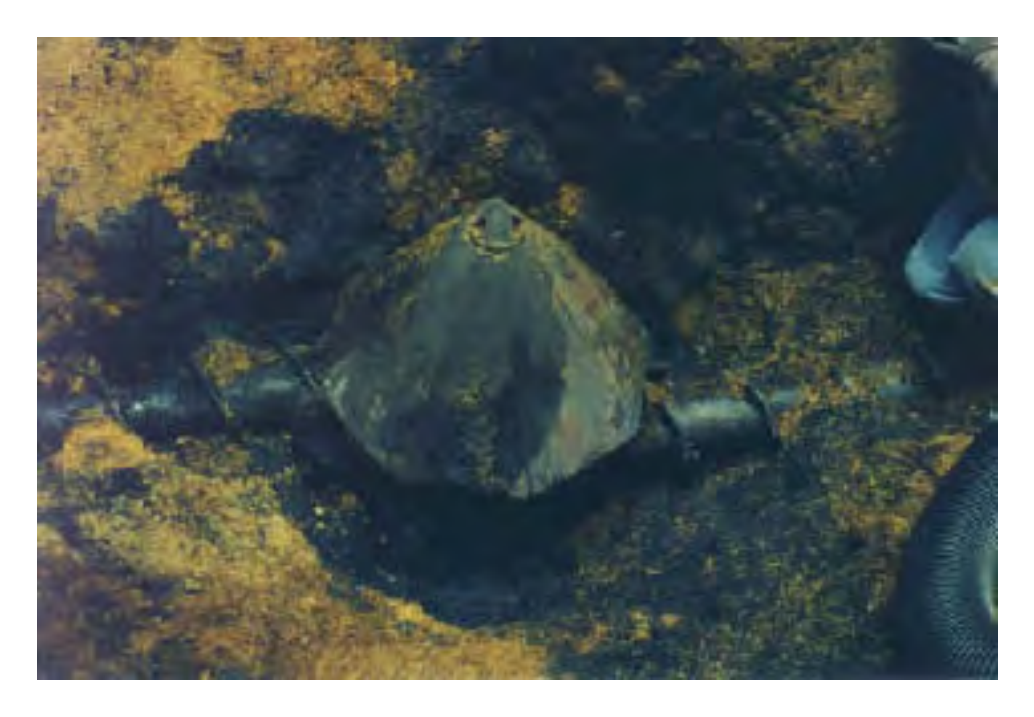
Photo 6. Auger gear box, covered by a shield suspected origin of fire