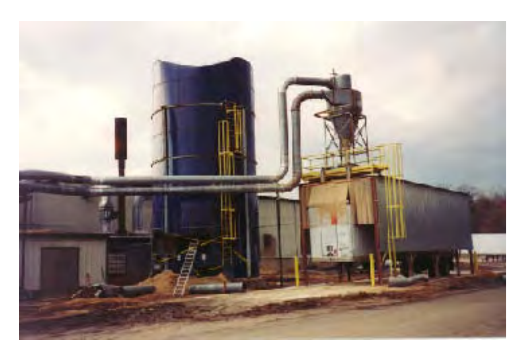
Photo 1. Silo with trailer shed to right and manufacturing facility in background