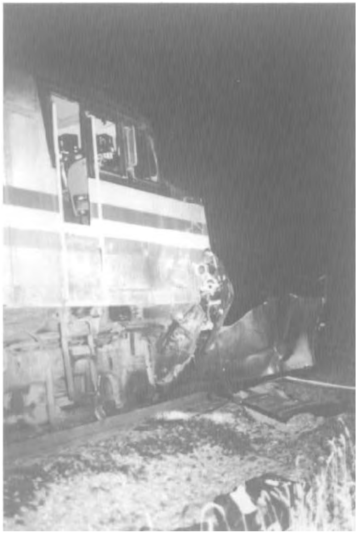
Right front of locomotive 319