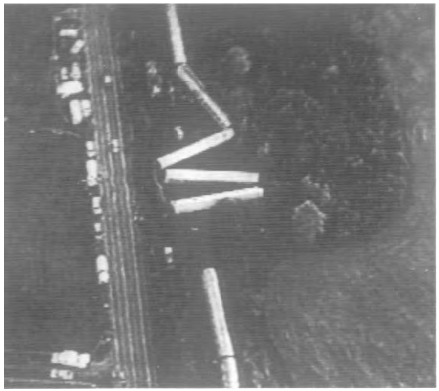
Aerial view of accident site