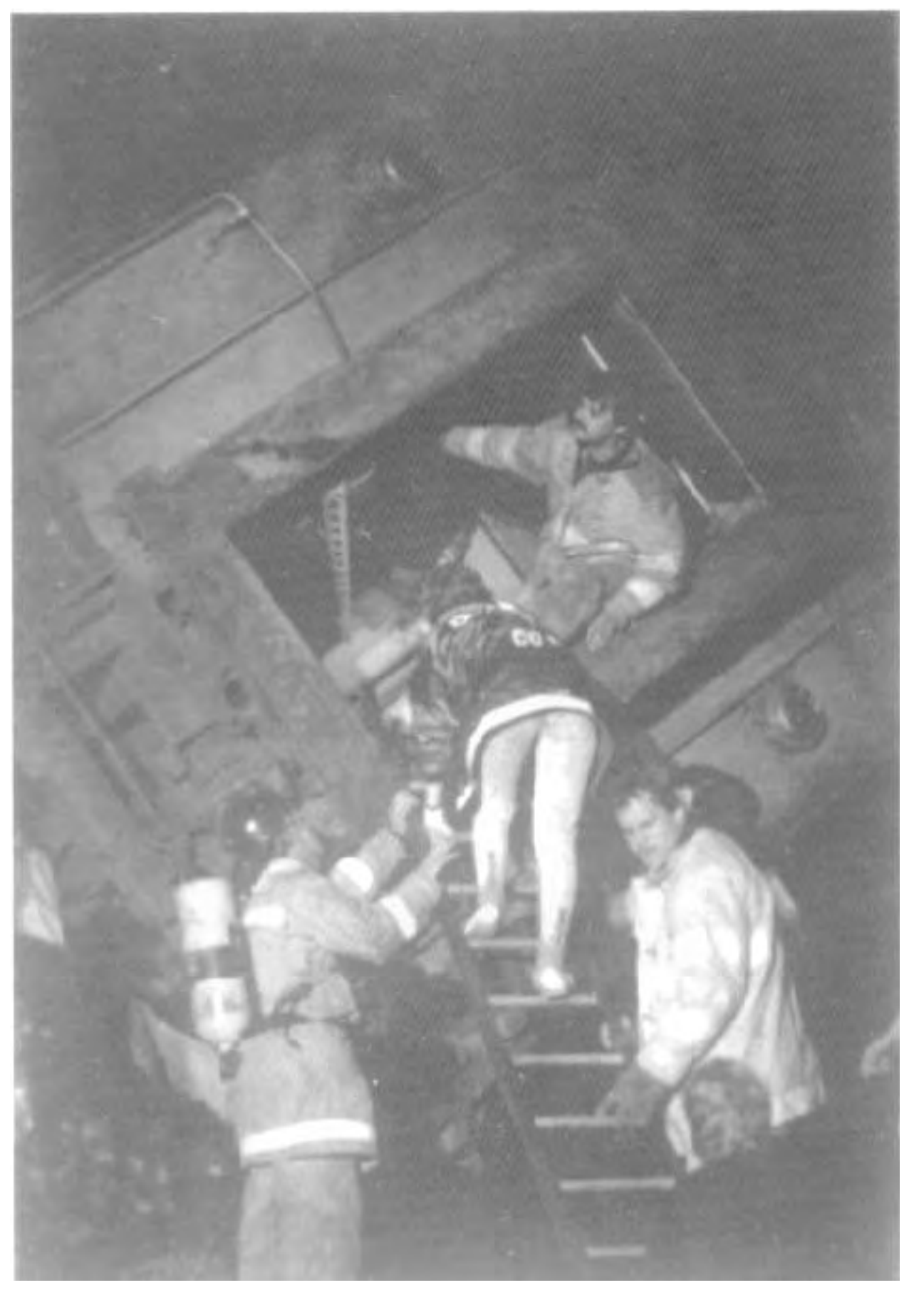
Evacuation operations from west end of car 4742