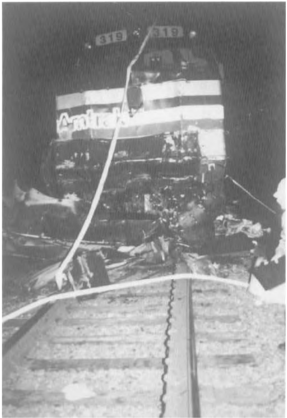
Front of locomotive 319