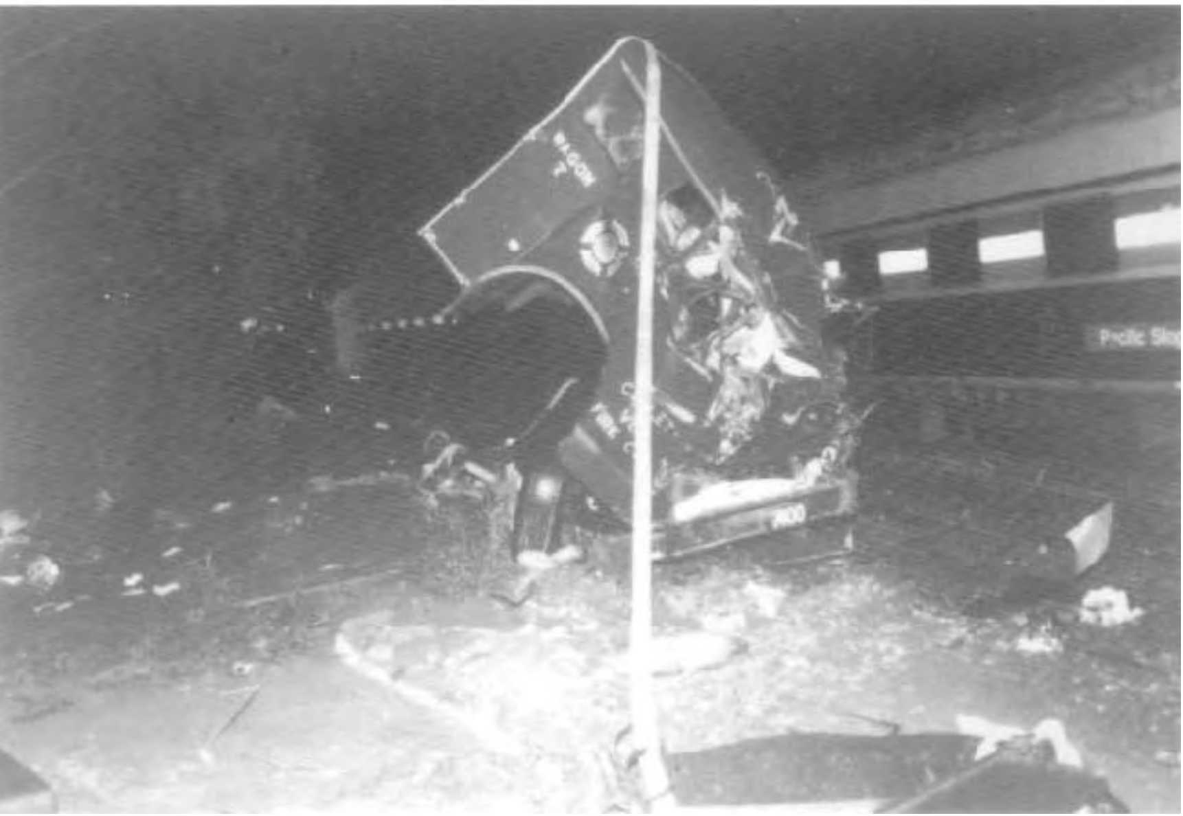
Cab of Wagon 7