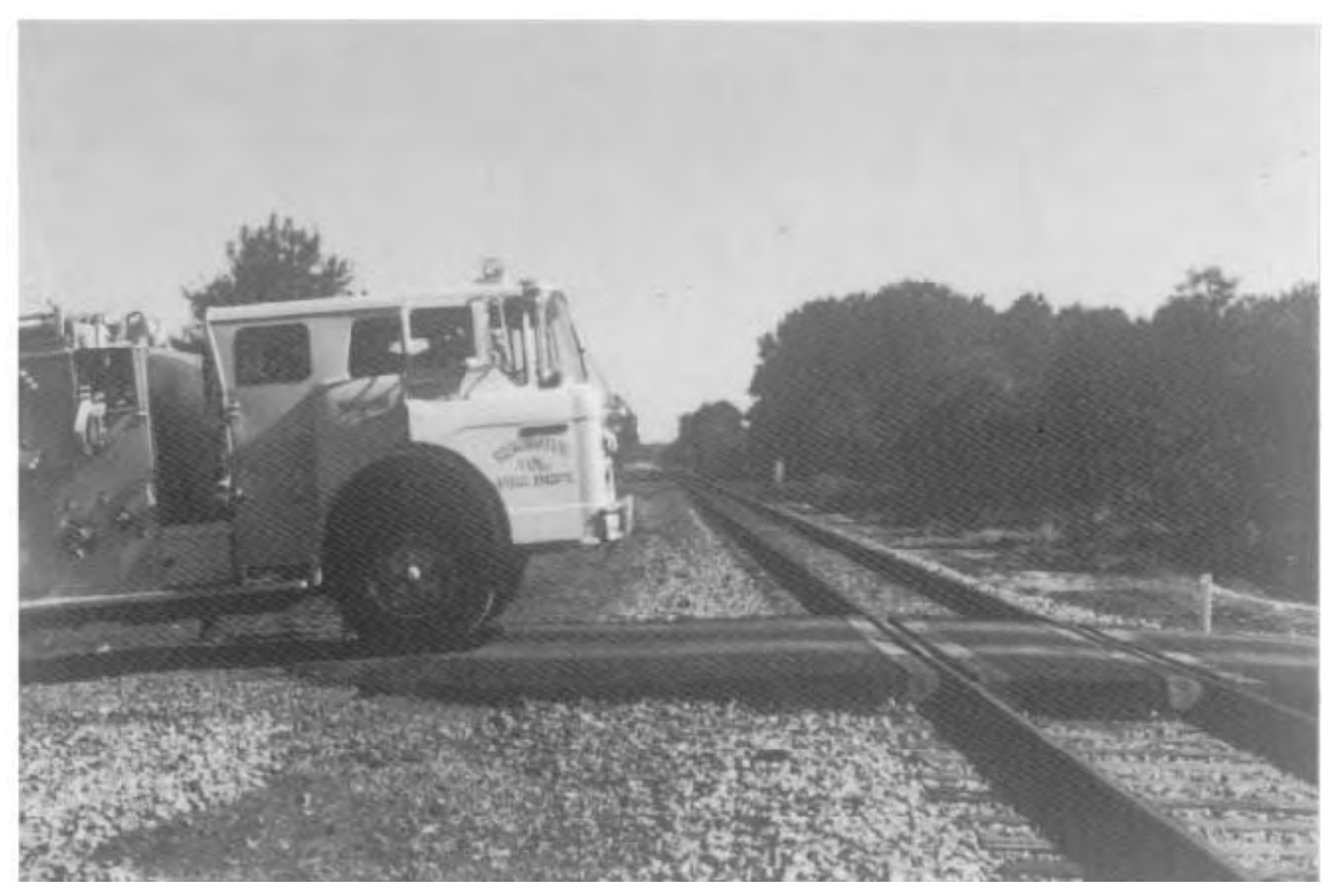
Wagon 2 at accident crossing - camera facing north