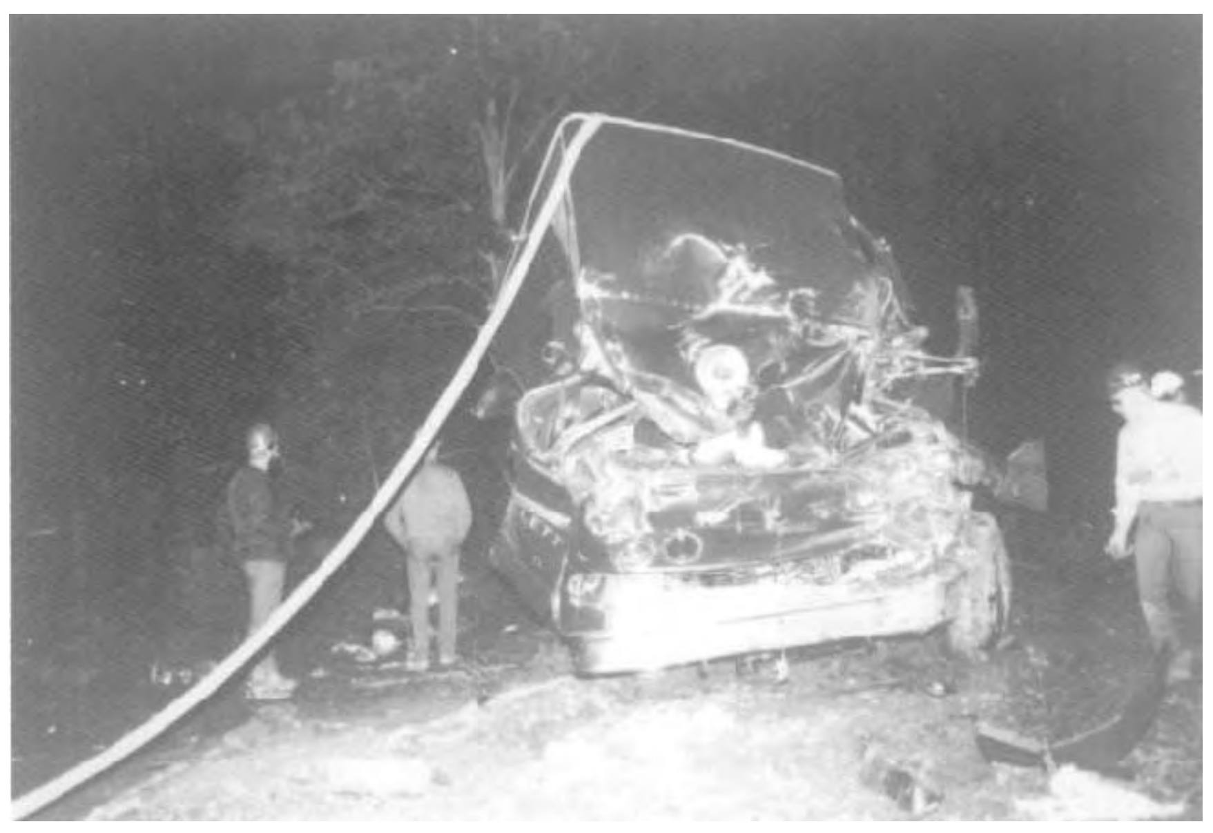
Cab of Wagon 7 - camera facing southeast