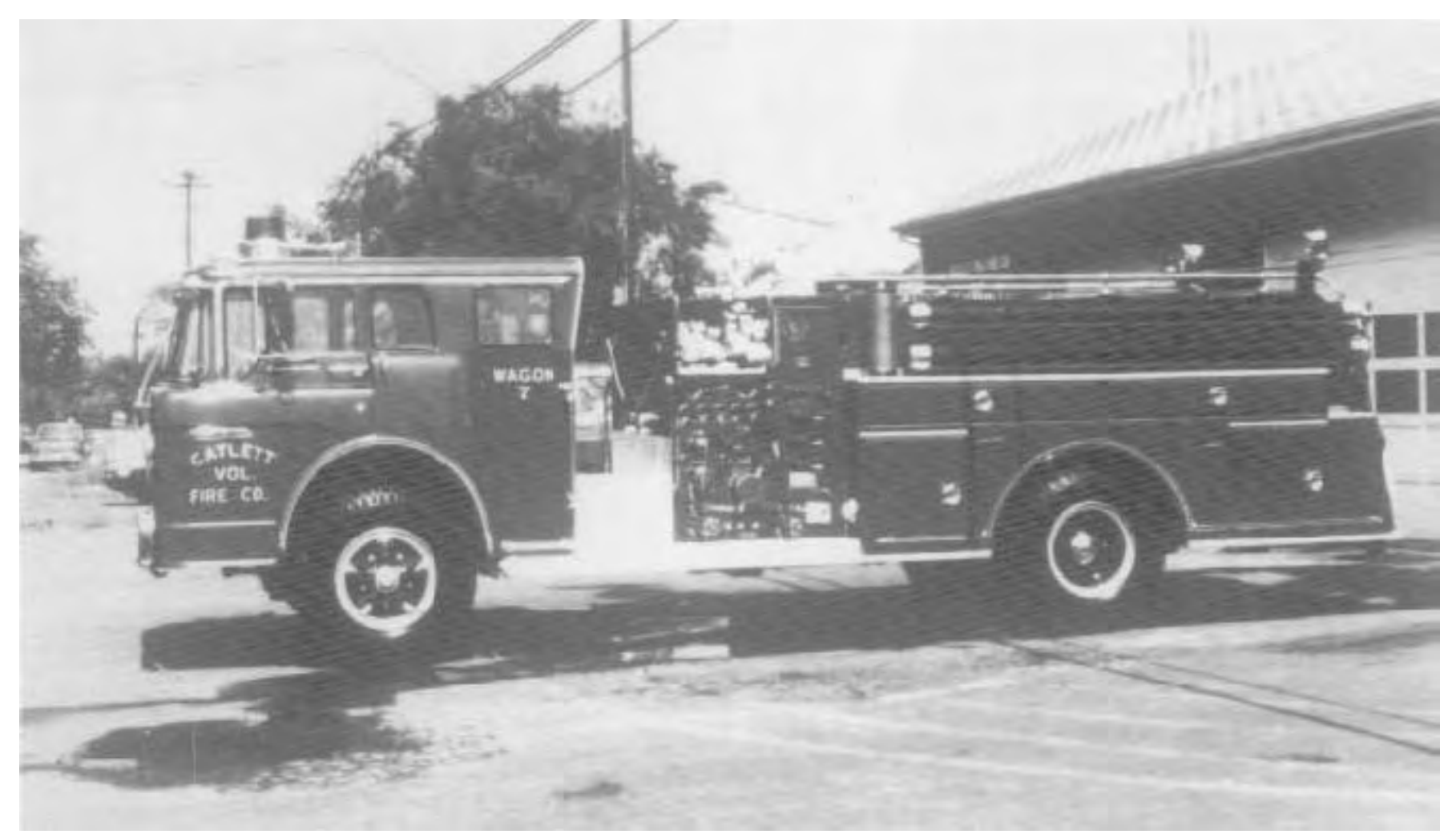
Left side of Wagon 7